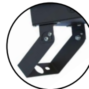
Trunnion Mount (LEDWPC-TM)