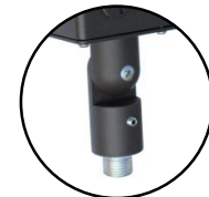
Knuckle Mount (LEDWPC-KM)