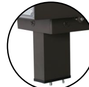
Square Arm (LEDWPC-A)